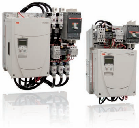
ABB offers thyristor-based digital DC drives for a wide variety of applications and in many configurations, including modules, panel drives, and complete drive solutions in cabinets. Both regenerative and non-regenerative drives are available. We also offer rebuild and upgrade kits specifically for retrofits to update the controls on existing DC drives. Power range is from 20 Amp (10 hp) to 5200 Amp (3000 hp) with packaged solutions up to 20,000 Amps.