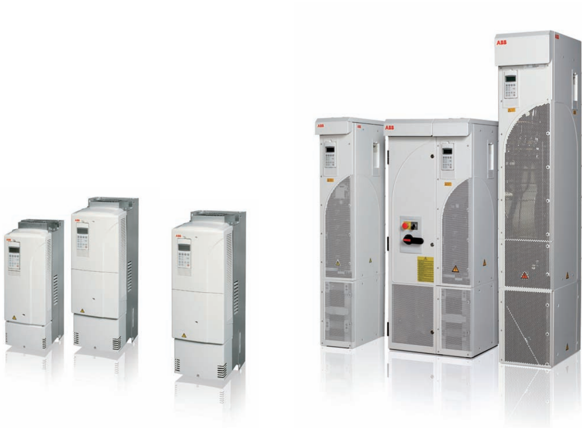
ABB low voltage AC drives ABB industrial drives