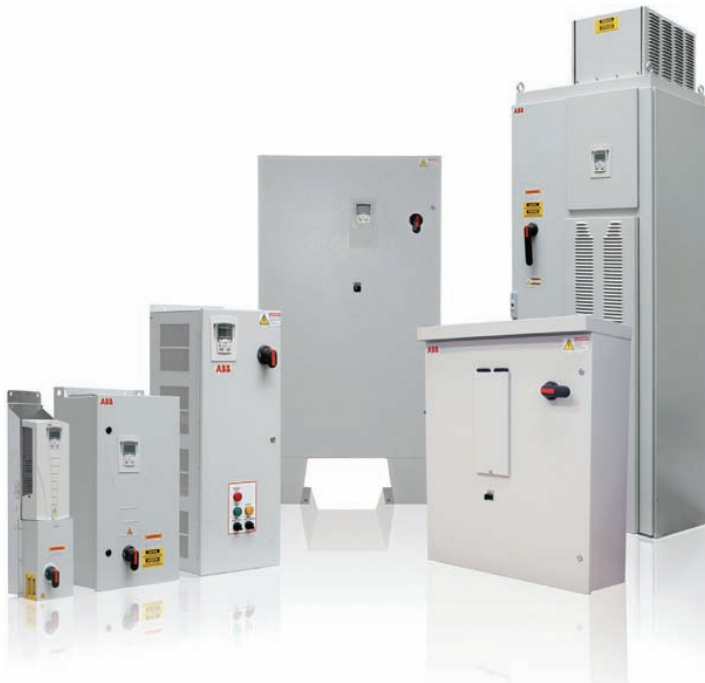
ABB low voltage AC drives ABB standard drives