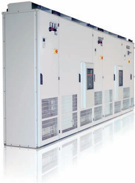
Cabinet-built DC drives