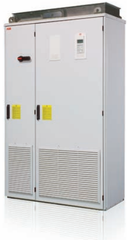
ABB low voltage AC drives ABB industrial drives