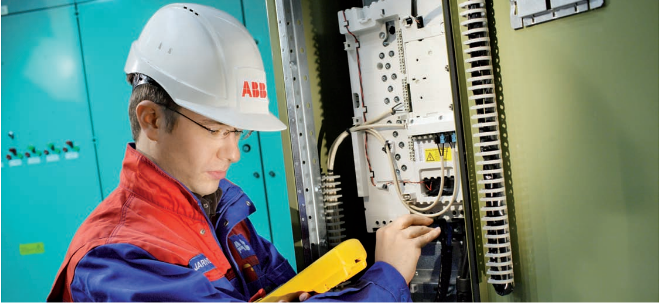
ABB has amassed a wealth of expertise on all aspects of drive systems applied to many different applications across most industries. Its dedicated experts talk your language and can offer the quickest route to a profitable solution, without forgetting personnel safety and environmental responsibility.