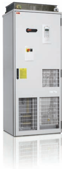
ABB cabinet-built single drives are drives that are mounted into a cabinet and the complete assembly is sold and delivered as one package. Often the cabinet will include additional accessories such as contactors, earth fault protection units, etc. These components are included when the term cabinet drive is used. Cabinet drives are typically made-to-order products.