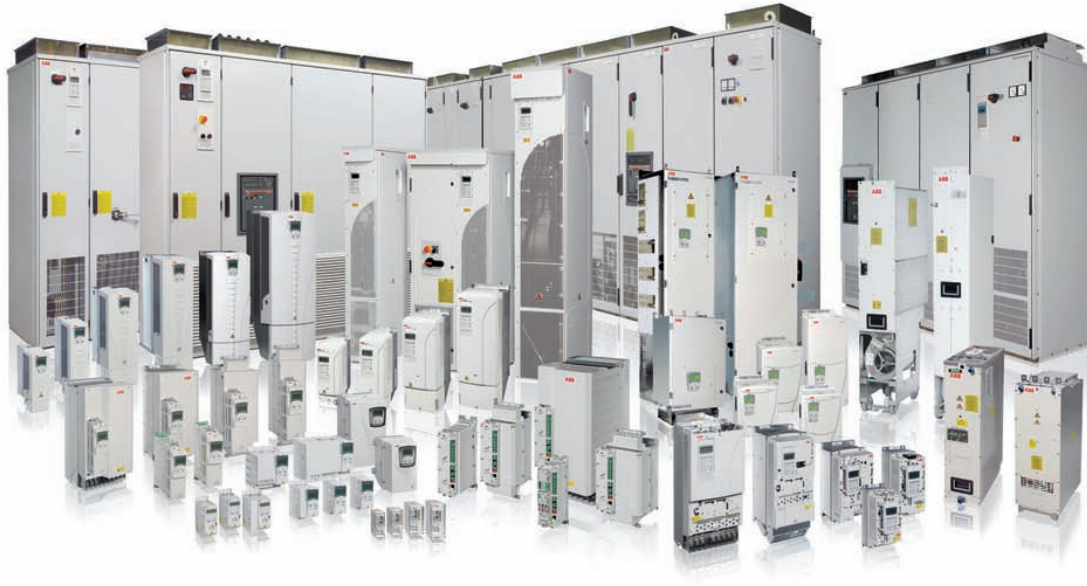
ABB machinery drives