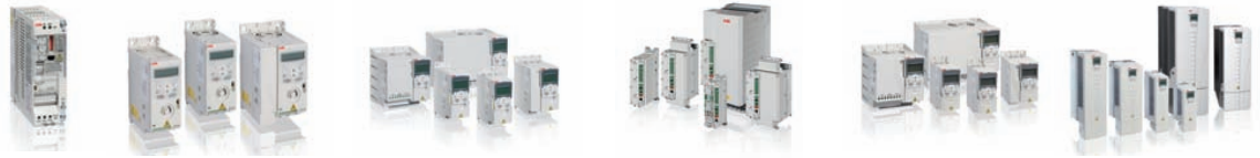
ABB drive feature comparison