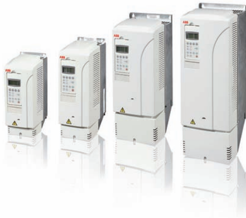
ABB single drives

ABB industrial drives are highly flexible AC drives that can be customized to meet the precise needs of industrial applications. The drives cover a wide range of powers and voltages, including voltages up to 690 V. ABB industrial drives can be built-in a number of differing formats: wall-mounted, free standing, cabinet, industrial kits, multidrives or liquid-cooled.